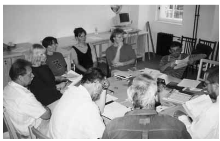
Appointment of Brno Transport Circle Association.

In the 90s, the administration of Brno (a city of roughly 400,000) gave up on progressive solutions (e.g. increased support for public transport) for the enormous growth of personal transport it faced, and decided for a conventional solution: construction of a bypass, which, however, is