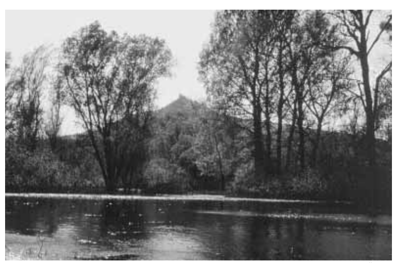
Floodplain forest before flood.

We focus primarily on nationwide causes and rural areas (we handle practically no Prague cases). Our work is always based on thorough legal analysis and legal steps on its basis. In order to increase the force of our legal argumentation, however, we also have expert studies written, and are no strangers to obtaining media coverage nor to helping citizens found civic associations.