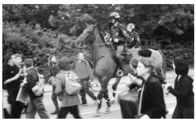
Police action at Brno's street party in June 2001.

(national daily Lidové noviny: report from an OPH seminar)