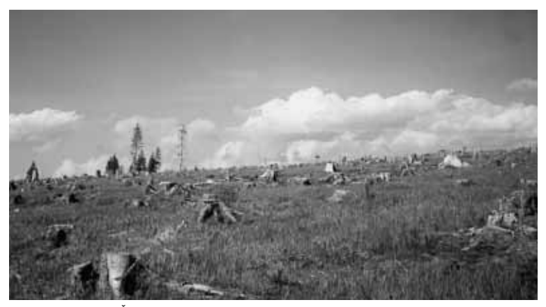
2. zone of National Park Šumava - after the "axe" cure of bark beetles.

We took part in the administrative procedure (oral negotiations and an appeal), where we objected to the Administration's bias and its inexpert manner of decision-making, motivated by an effort to hide its own professional mistakes and white-collar crime at the Park. The Administration's director inspected our complaint of bias and reached the conclusion that the officials granting the permit are not actually his subordinates, as he is merely entitled to