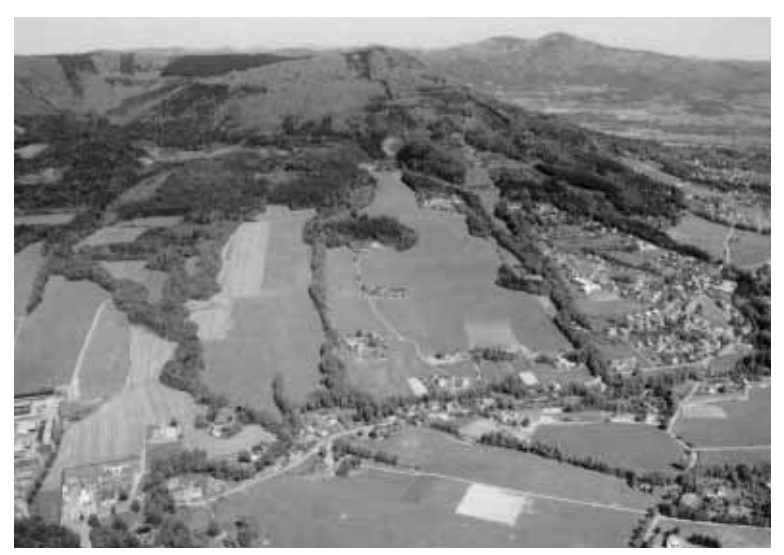
Čeladná village - future paradise for golf players.

Beskydčan, a civic initiative from the village of Ostravice in the heart of the Moravsko-Slezské Beskydys nature reserve, is defending the local environment.