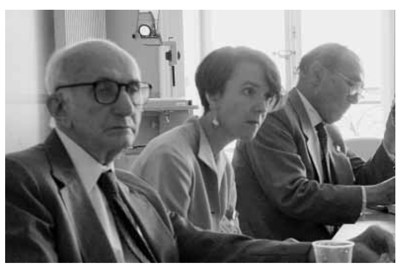
Members of the UN Committee for Human Rights during presentation of OPH, OMCT and FIDH reports.

Thanks to the presence of OPH members, we also had the chance to promote before experts the other topics we cover, particularly domestic violence. This was reflected in a Committee demand to increase protection for such violence's victims under Czech law (point 14). This point explicitly called attention to the need for restraining orders against violent partners' entering victims' residences.