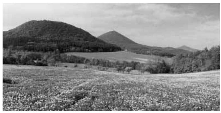
České středohoří will offer a nice panorama of the nature reserve for car drivers.

Last year, the Minister of Environment unlawfully granted final approval to the construction of a highway through this nature reserve, and supported the proposal by Ředitelství silnic a dálnic ČR (the state-funded organization responsible for administering and maintaining roads and roadrelated property), which completely ignores environmental protection interests in this uniquely valuable site. In refusing our appeals against his granting the exception from the law (which does not allow highways to be built in nature reserves), the minister set a dangerous precedent for other planned, controversial road construction in our country. We thus continued in 2001 our cooperation with Children of the Earth, the Czech civic association that leads the campaign against construction of highway D8's approved variant. We made nearly a dozen legal filings against the