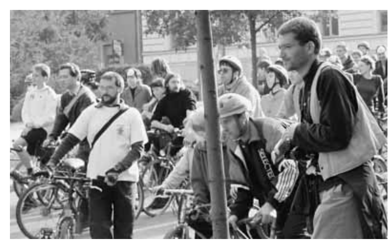
Legal observers at Car-Free Day.

The legal steps that OPH took against police illegalities towards demonstrators in September 2000 justifiably caused a stir. And so in 2001, police were careful not to break the law during peaceful demonstrations of minority groups where OPH volunteers stood by in their signature blue jackets. All