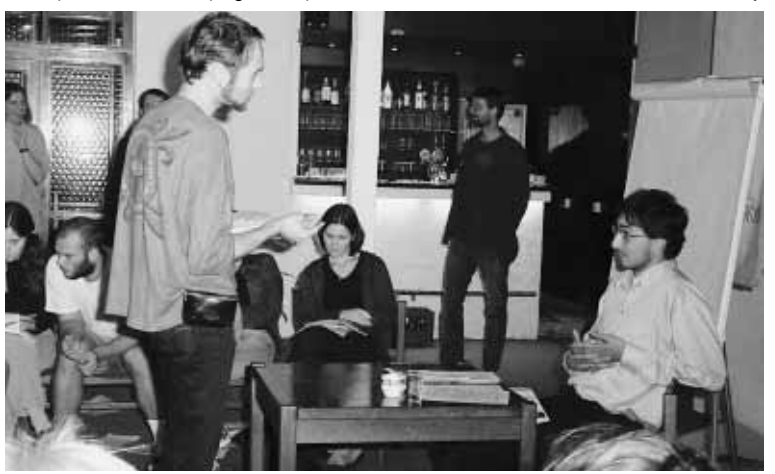
Model situation of an administrative proceeding.

EPS's 2001 Human Rights School took place from early evening of Sunday, September 16<sup>th</sup> to the morning of Saturday, September 22<sup>nd</sup>, in the Kozí Horka hotel near the Brno reservoir lake. Participants attended the program, slept, and took their meals within the hotel. Students from any