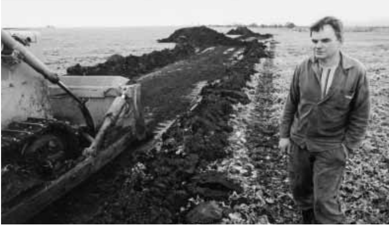
One of the few worthwhile lands in North-Bohemia.

"Investors like green fields. They like birds and forests. There are brown fields [unused, ecologically degraded areas] in Most, but why would we build a factory in the middle of a [former] coal pit? They would have to pave the roads with gold for us to go there."