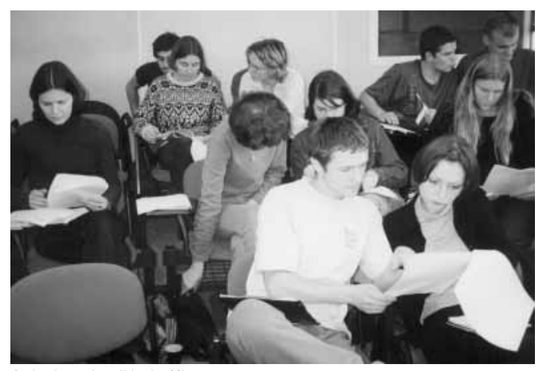
Continuation meeting at University of Olomouc.