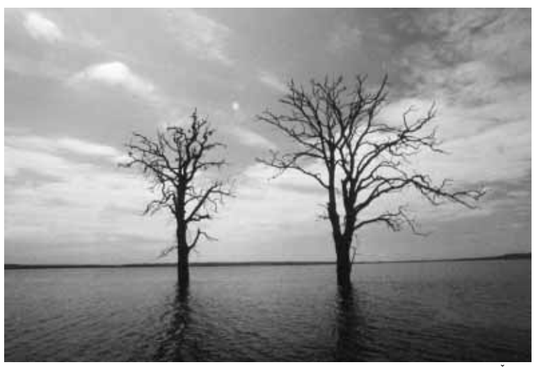
Floodplain forest after flood.

We participated in all permit proceedings, submitted dozens of legal filings, filed suit at the Prague