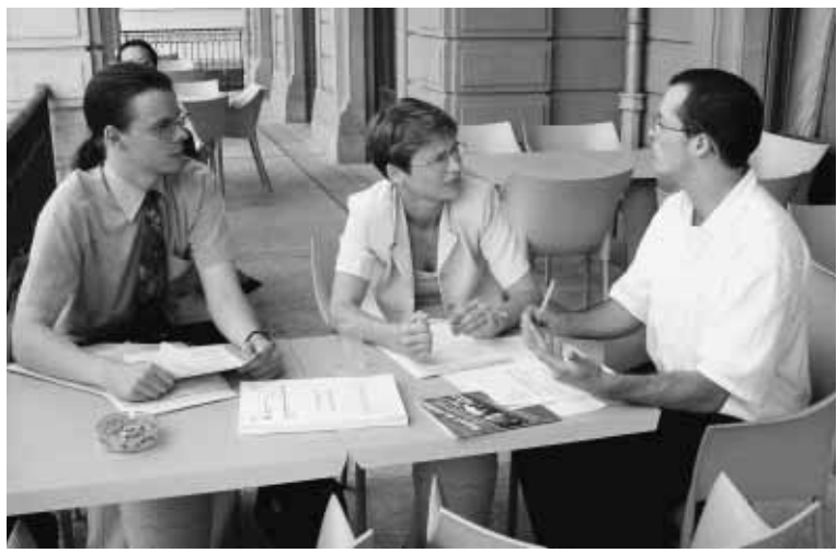
Appointment with the assistant of the Special Reporter of the UN Committee Against Torture.

One result of our mission was the inclusion into the Human Rights Committee's summarizing