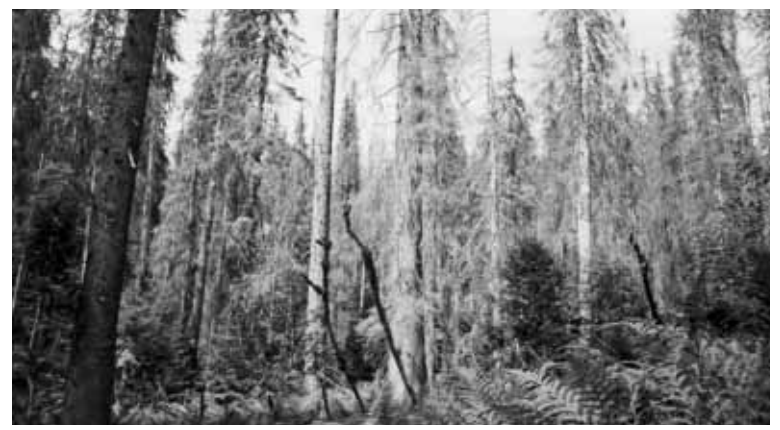
1. zone of National Park Šumava - without treatment.