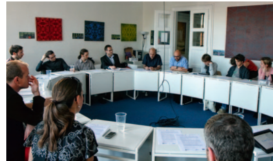
Meeting of anti-corruption organizations

Between November and the end of 2011, this set of requests received a support from 12 leading anti-corruption organizations and 5,000 individuals.